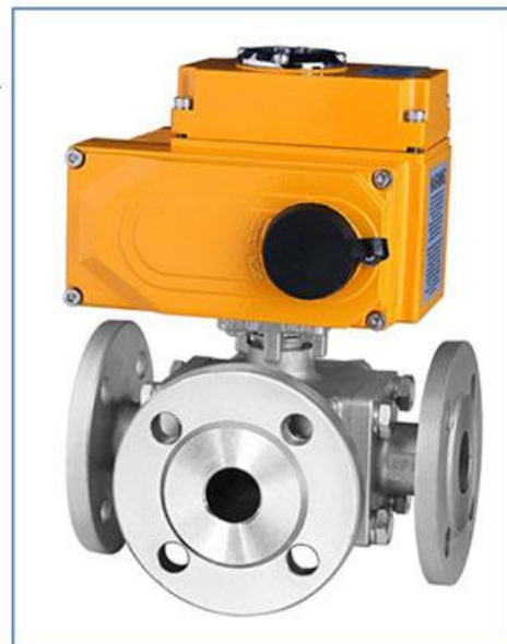
ZQ Three-way flange electric ball valve Schematic diagram of media flow direction